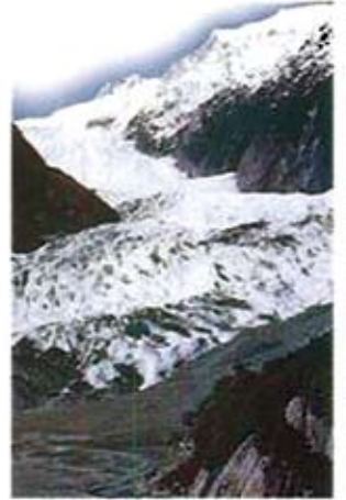
il ghiacciaio glacier