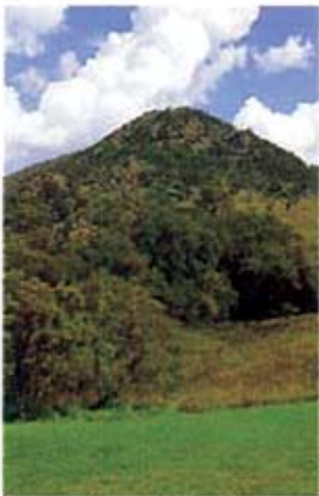
la collina hill