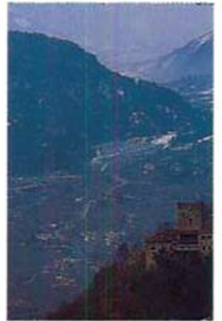
la valle | valley