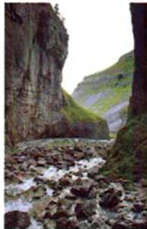
la gola gorge