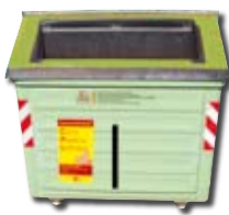
Multimaterial Public Street Container

Aluminum, cans and metal must be disposed of