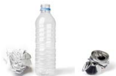
Paper and cardboard P lastic Cans

Refuse separation collection system will change starting 06 October 2018 New procedures will be posted on the Aviano AB recycling website before 6 October 2018.