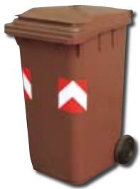
Public street container