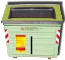
Multimaterial public street container